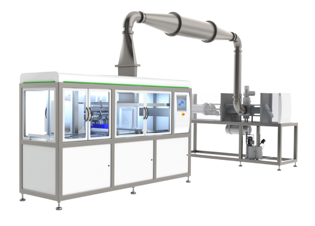
PLATE-packaging machine BPM 2000